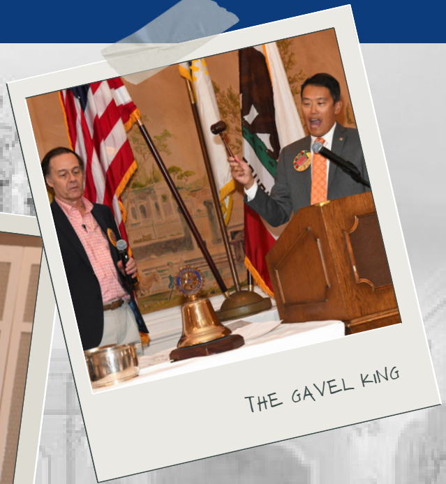
THE GAVEL KING